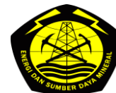
Ministry of Energy and Mineral Resource