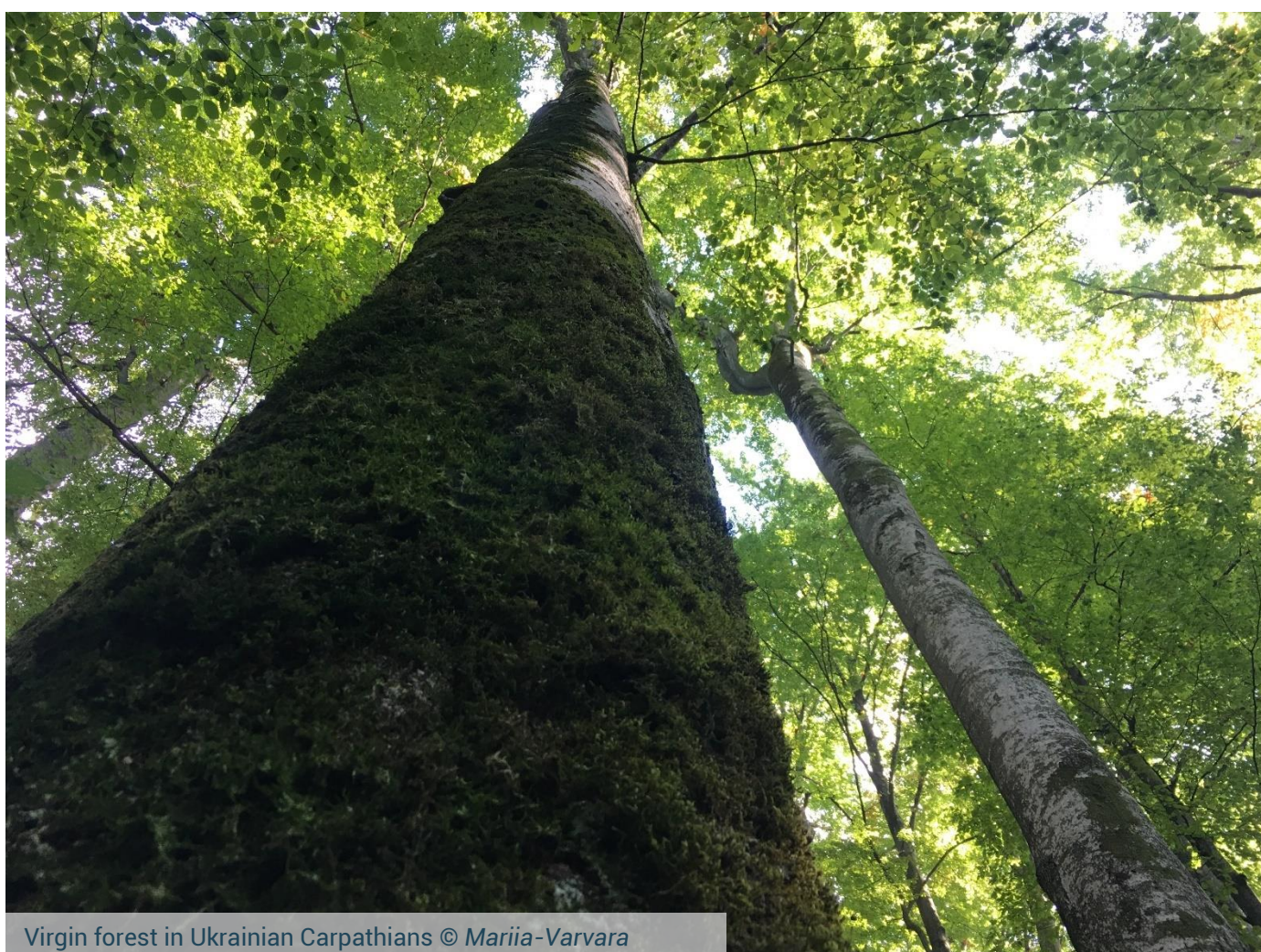
Virgin forest in Ukrainian Carpathians