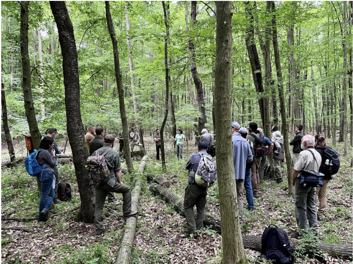
Figure 5. Workshop for forestry practitioners on close-to-nature silviculture and climate-smart forest management, held in the Börzsöny Mountains of Hungary, June 2023 15 .

The CLIMAFORCEELIFE project was launched at an opening conference held in Bratislava, Slovakia in October of 2021, organized as part of the EU Strategy for the Danube Region 10 th Annual Forum. The event brought together over 130 forest experts, scientists, and stakeholders from across the greater region, resulting in a large number of presentations and resource about climate change and forest adaptation in the Carpathian region that are now available online 16 . CLIMAFORCEELIFE recently partnered (see Error! Reference source not found. figure 4) with a project funded by the Trust for Mutual Understanding (W.S. Keeton and R. Aszalos P.I.s) called Bridging the Divide between European and North American Perspectives on Ecological Silviculture . The latter initiative has conducted several scientific exchange events in Romania, Hungary, Slovakia, Czechia, and the United States of America. These events facilitated the sharing of experiences and information around climate adaptive forest management from the Carpathian and U.S. perspectives.