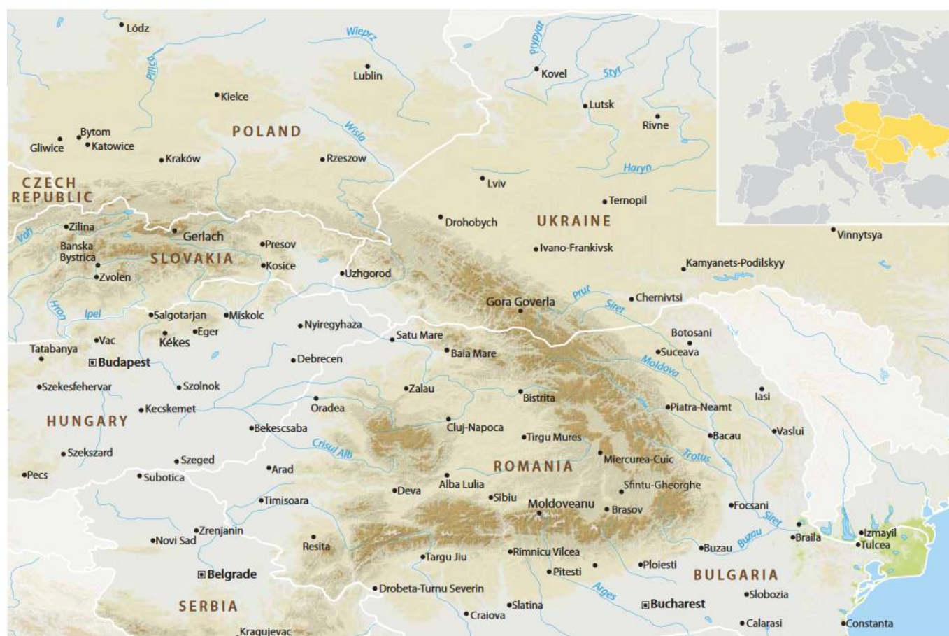
Figure 1. The Carpathian region territory covering seven countries. (GRID-Arendal, 2014) 2

For this reason, the Carpathian region is recognized as having global cultural and ecological significance by the United Nations Educational, Scientific and Cultural Organization (UNESCO). Large, uninterrupted and inaccessible expanses of forests provide refuge for populations of large European mammal species, such as the lynx, river otter, grey wolf, woodland bison, red deer, moose and brown bear. Found only in this region are over 200 species of endemic plants and stands of virgin 3 European beech forests with areas larger than 10,000 ha. Subranges like the Făgăraș in